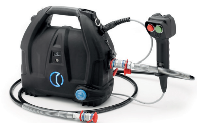
B70M-P36 Portable electro-hydraulic pump