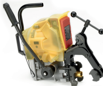
LD-16B-RP Rainproof rail drilling machine