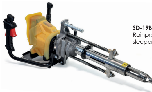
SD-19BR-RP Rainproof sleeper drilling machine